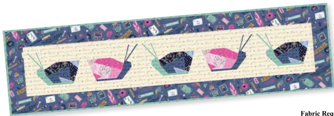
Table Runner Finished Size: 52" x 14" Pattern also includes Baby Quilt & Wall Hanging Sizes